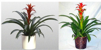
Bromeliads—12"-18"H $90.00 each