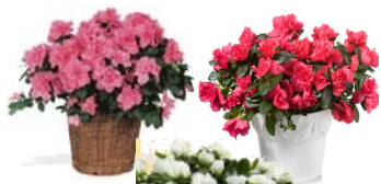
Azaleas—12"H $90.00 each