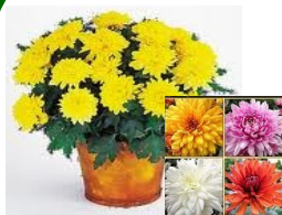
Mums—12"-18"H $60.00 each